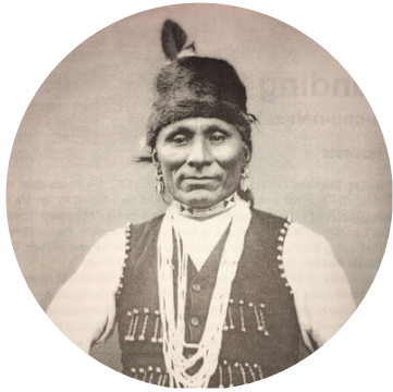
Chief Standing Bear (1834-1908)

“My hand is not the same color as yours. If I pierce it, I shall feel pain. If you pierce your hand, you too will feel pain. The blood that flows will be the same color. I am a man. The same God made us both.”