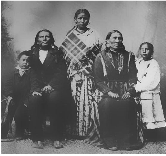
Standing Bear with his family