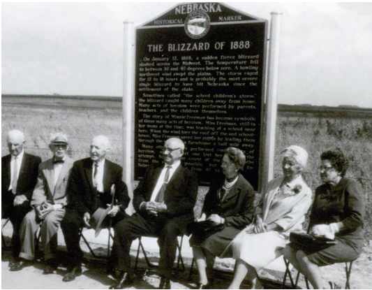
January 12, 1888 Blizzard Club, Historical Land Mark Council, Nebr. 70, South of Ord

Many other teachers performed similar acts of heroism, and at least one lost her life in the attempt. No accurate count of the total deaths from the storm is possible, but estimates for Nebraska have ranged from 40 to 100.