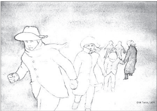
© 1991 “Big Brash Blizzard of 1888” by Dick Taylor

Compare this sketch with the mosaic on the front of the poster. Which image is most realistic? Which gives the most emotion? How can art be a means for us to celebrate our heroes and express ourselves and heal after following disasters?